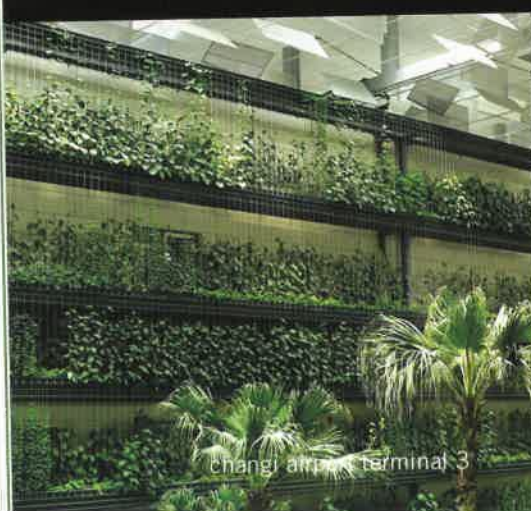
changai airport terminal 3

ARCHITECTURAL LANDSCAPE DESIGNER CHANGI AIRPORT TERMINAL 3