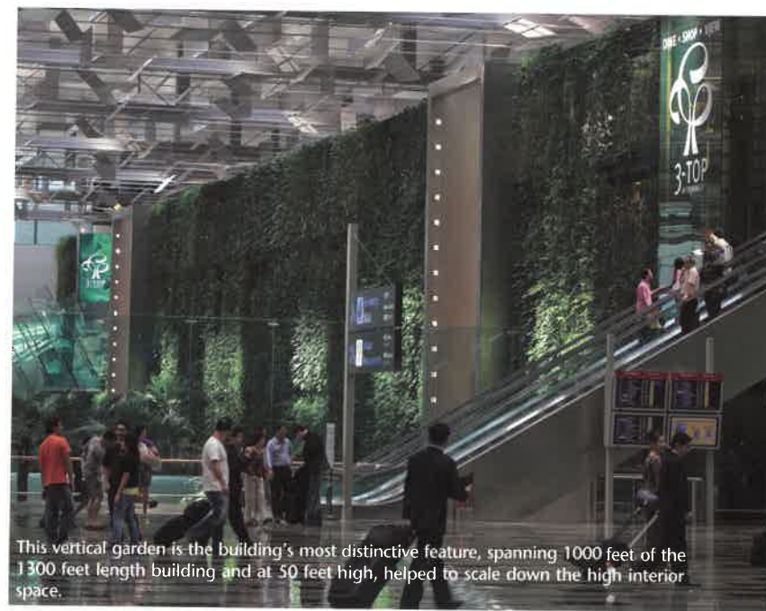
This vertical garden is the building's most distinctive feature, spanning 1000 feet of the 1300 feet length building and at 50 feet high, helped to scale down the high interior space.

- 녹색 웅단은 매달려 있는 구조 뒤의 좁은 통로에 유지되도록 디자인 되었다. 짐쇠 없이 구조적 골조에 고정된 스테인레스 스틸 케이블에서 식물은 컨테이너에서 미리 성장한다.