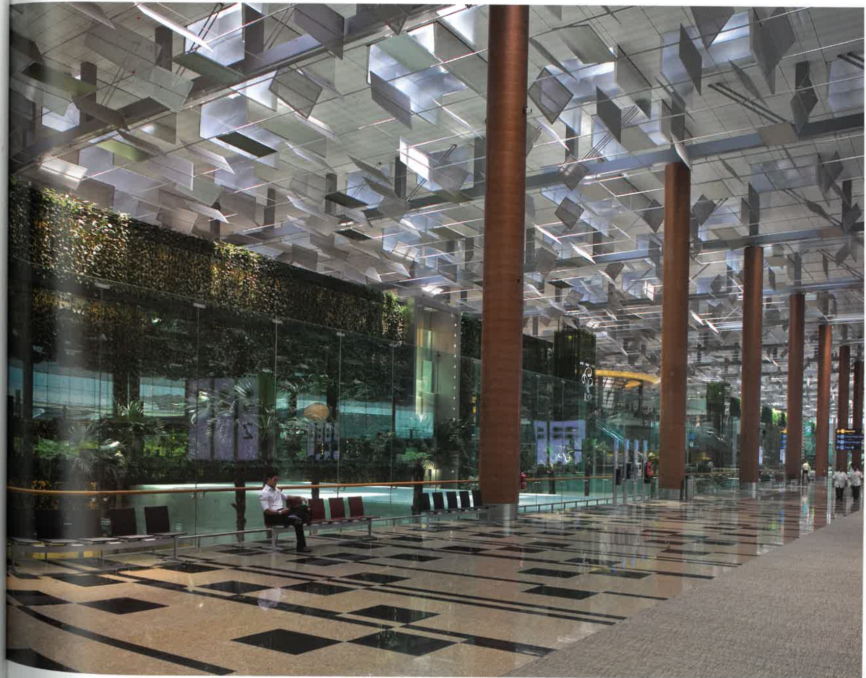
The green tapestry is not merely a decorative accent but a bold environmental statement complementing the architecture, demonstrating that landscapes as architecture is capable of humanizing the interior environment of an enormous and complex building.

The water features 60 feet tall and 20 feet wide made from shredded glass panels laminated to stainless steel plates, were added to compliment the wall of green. Their shimmering water movement adds texture to create a rhythm of moving light and sparkle against the elegant silence of the tapestry.