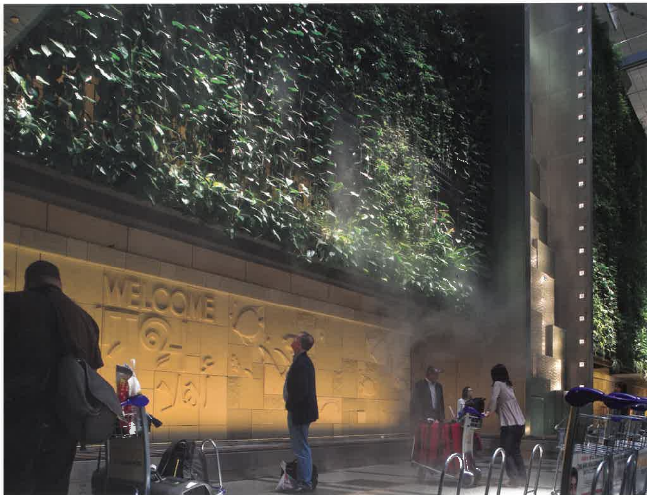
ity is replenished by a misting system