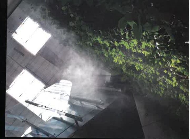
The green tapestry exhibits the richness, diversity and character of the Southeast Asian Equatorial Rain Forest. Its bold, dominant form creates a powerful identity for the terminal's vast space.