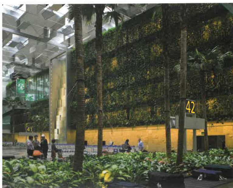
Perpendicular to the tapestry on the arrival level floor are wide planters with a variety of massed ground covers and majestic